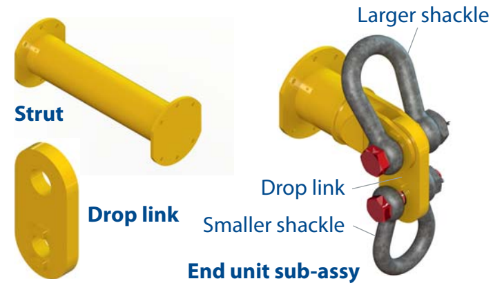
Table 1 - Component List