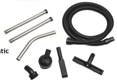
38mm D1 A5 Dry Vac Anti-static Tool Kit